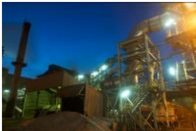
Pomalaa Ferronickel Plant