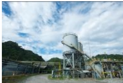
Pongkor Gold Mine