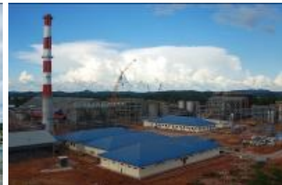
Tayan CGA Project