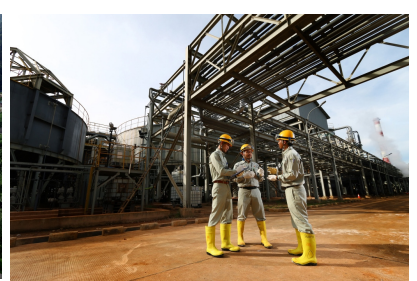
Pomalaa Ferronickel Plant