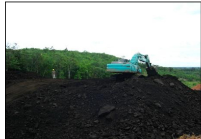
Sarolangun Coal Mine