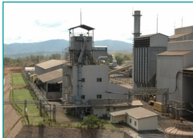
Feronickel III Plant, Pomalaa