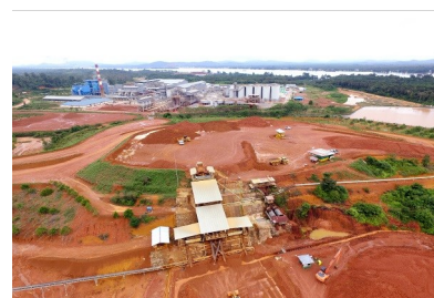
Tayan Bauxite Mine