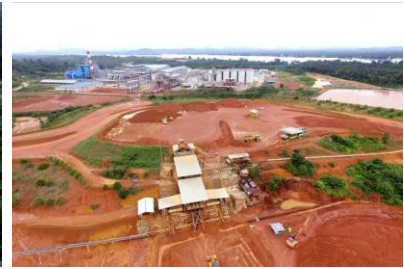
Tayan Bauxite Mine