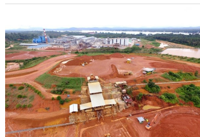
Tayan Bauxite Mine