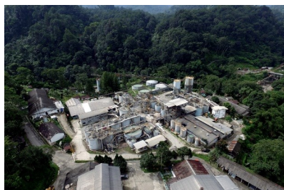
Pongkor Gold Processing Plant