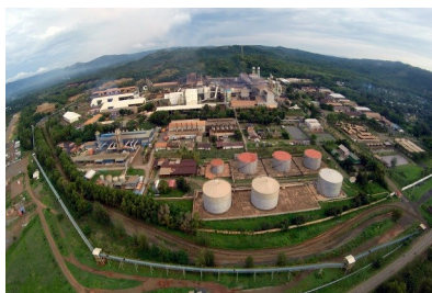
Pomalaa Ferronickel Plant