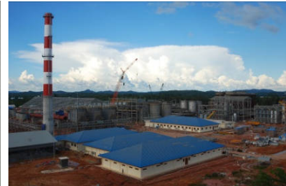
Tayan CGA Project