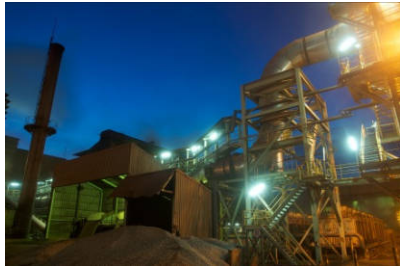
Pomalaa Ferronickel Plant

For the Three Month Period Ended December 31, 2013 ARBN - 087 423 998 Securities Ticker: ASX: ATM; IDX: ANTM