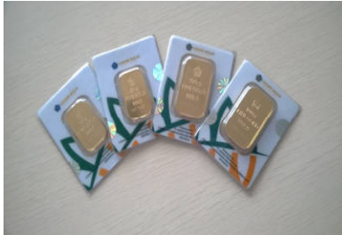
Logam Mulia's Gold Products