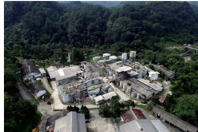
Pongkor Gold Processing Plant