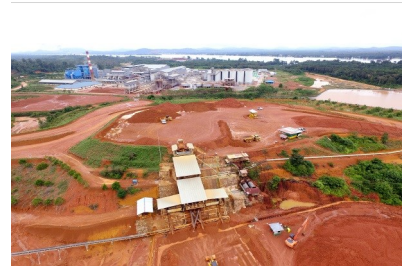
Tayan Bauxite Mine