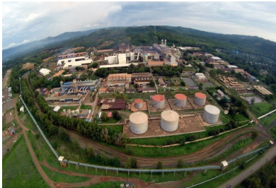
Pomalaa Ferronickel Plant