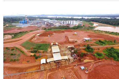
Tayan Bauxite Mine