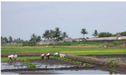
Rice field on former iron sands mine site at Cilacap.

Following Cilacap mine closure program, Antam began post-mining activity by focusing on environmental rehabilitation and development of local economy through implementation of Corporate Social Responsibility (CSR) programs. Antam rehabilitated 422.8 hectares as part of its environmental management work at Cilacap.