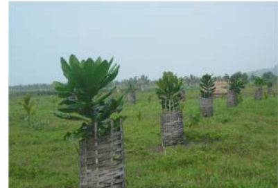
Reclamation on former iron sands mine site at Cilacap, using Terminalia Catappa .

"Antam's reclamation program on former iron sands mine site at Cilacap will contribute positively to the surrounding communities. Antam's good mining practice at