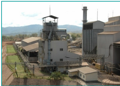
Ferronickel Plant III, Pomalaa