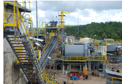
Gold Plant, Cibaliung