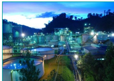
Gold Plant, Pongkor