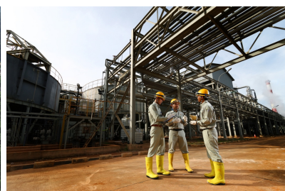
Tayan CGA Plant