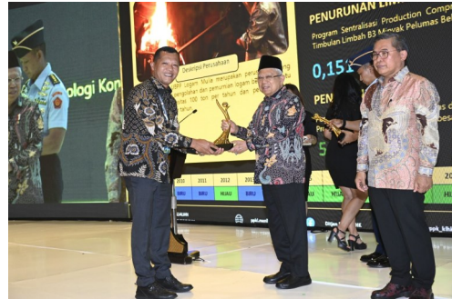
ANTAM Receives Two GOLD PROPERS 2023