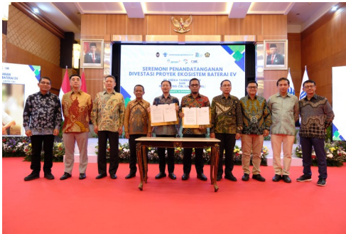
Signing of Cooperation Agreement of EV Battery Ecosystem Development