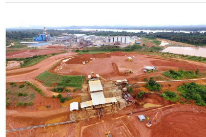
Tayan Bauxite Mine