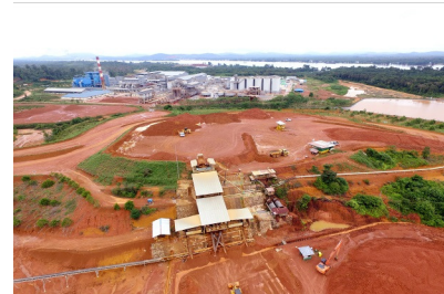
Tayan Bauxite Mine