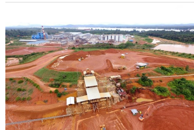
Tayan Bauxite Mine