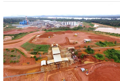
Tayan Bauxite Mine