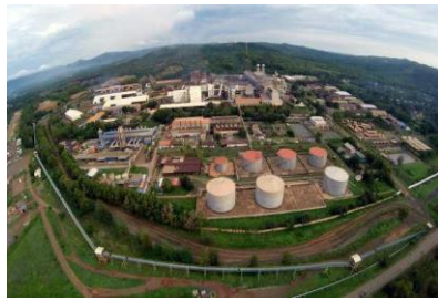
Pomalaa Ferronickel Plant

For the First Nine Months Ended 30 September 2024 ARBN - 087 423 998 Securities Ticker: ASX: ATM, IDX: ANTM