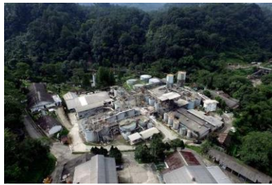
Pongkor Gold Processing Plant