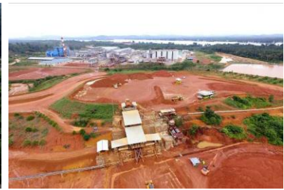
Tayan Bauxite Mine